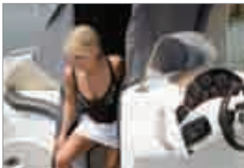
Changing room & porta-potty