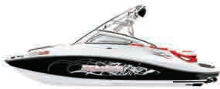
Viper Red / Black